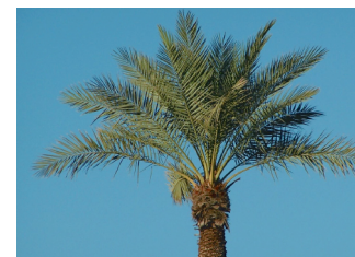
Properly pruned date palm

The use of climbing spikes should be minimized. Even though most street landscaped palms can be pruned safely from an aerial lift, some palms still need to be climbed. Palms do not compartmentalize and seal wounds like trees. Injuries to palm trunks are permanent. Retaining the petiole bases or peel on palm trunks helps protect palms from spike injury.