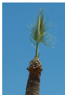
Severely over-pruned fan palm

Palm fronds should not be pruned higher than fronds originating at a 45-degree angle from horizontal. This method retains adequate live, green fronds to produce food for the palm while removing brown, dead fronds and fruit stalks. Date palms often are pruned to fronds originating at a 60-degree angle from horizontal to provide a fuller, more tropical look.