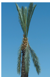
Severely over-pruned date palm

Although people often refer to palms as "trees," they technically are not true trees. Palms are considered arborescent monocots, or "tree-like grasses." Palms differ structurally from trees in the development and organization of growth cells.