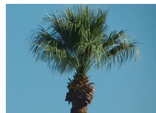
Properly pruned fan palm

to be patient and wait for the flowering cycle to be complete. Otherwise, if pruned too early, additional flower stalks may develop and will hang from the palm head the remainder of the year.